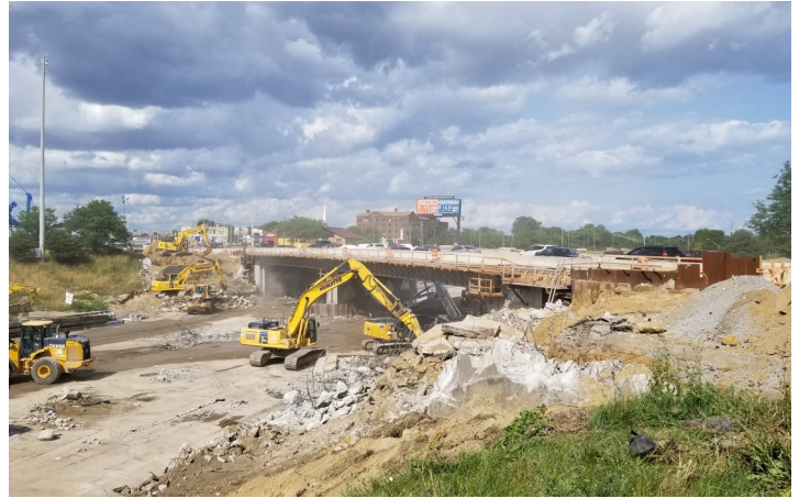
One side of Gratiot Avenue bridge is open for traffic and the other is demolished and ready for construction.