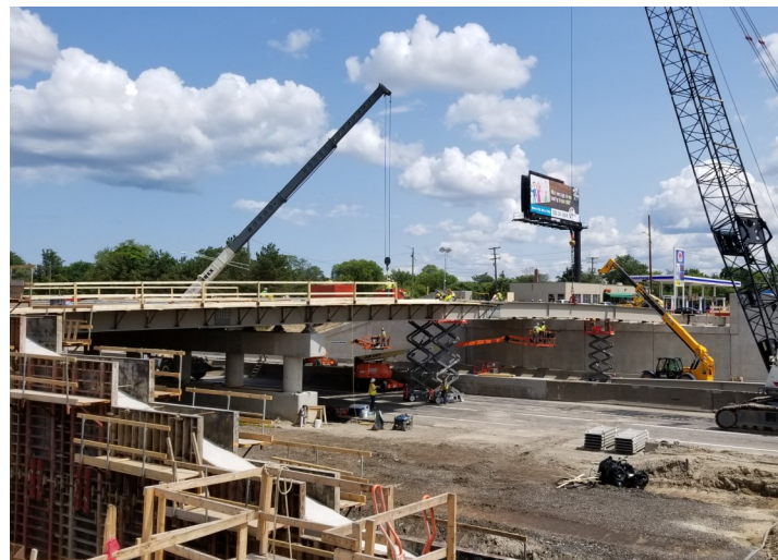
Workers install steel beams at the Chene Street bridge.

The Chene Street team focused on splicing together and placing steel beams. The beams were assembled and set to accommodate the new bridge both now and in the future, when the freeway will be shifted 50 feet north of its current alignment.