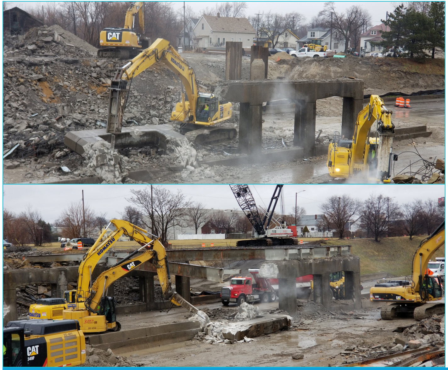
Demolition at the French Road and Concord Avenue bridges in late March.

It's very early in the construction season, but the reconstruction of the three bridges along I-94 – at Brush Street, French Road, and Concord Avenue – are already underway. Within the last month, each of these 1950s-era structures has been (mostly) demolished. The only element still standing is the center pier of the former Brush Street bridge. According to MDOT Project Engineer Kay Adefeso, traffic will soon be shifted to the right side of the roadway to give the construction team room to remove it. If you drive by over the next few weeks, you will also see excavation happening on the north and south sides of the site as prep work gets underway for new bridge abutments.