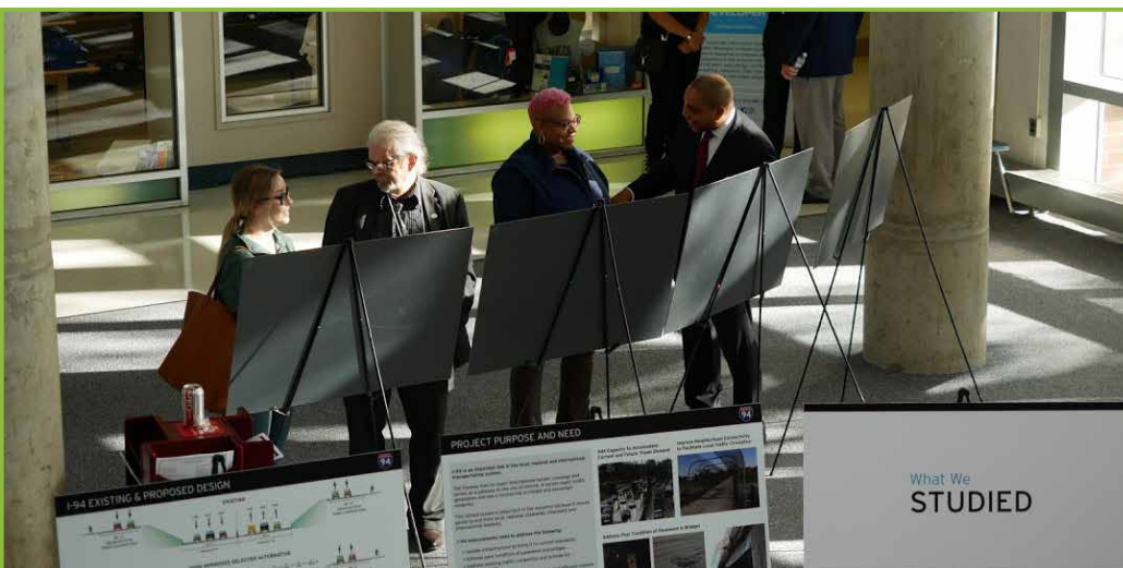
Public hearing held at Wayne County Community College District - Eastern Campus.