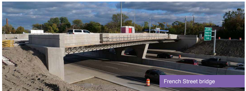
French Street bridge