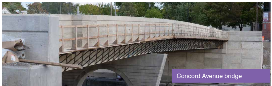
Concord Avenue bridge

“The French Road bridge deck is essentially complete except for decorative fencing. We’re working on traffic signals, sidewalks and many other items. The Concord Avenue bridge deck barrier wall has been installed and decorative fences will be installed soon. We’re also working on the service drives north and south of the freeway. The best news is that both bridges will be open to traffic by Nov. 15 and we’ll only have some punch list items and sidewalks to complete after that date.”