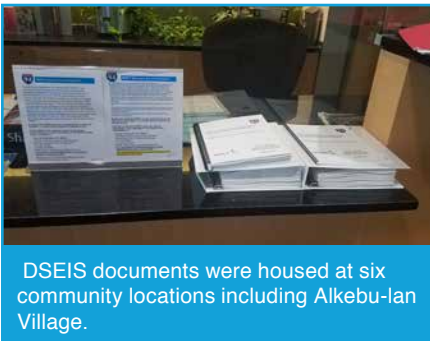
DSEIS documents were housed at six community locations including Alkebu-lan Village.

Hosting public hearings and providing community access to the document are major requirements of the federally mandated DSEIS public comment process. Completing these essential steps would not have been possible without the support of community partners. The I-94 project team thanks the following partners for their ongoing support and assistance.