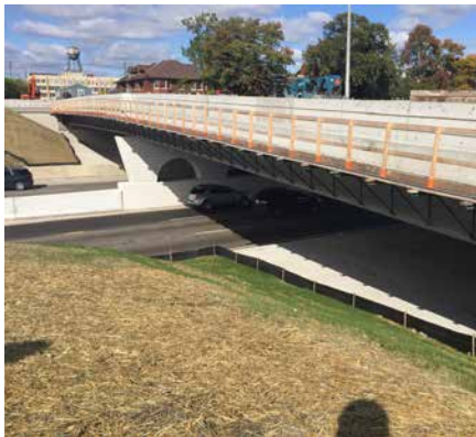
Brush Street bridge

With the reconstruction of the Brush Street, Concord Avenue and French Road bridges underway, it has been a very productive construction season for the I-94 project. The good news: All three are headed for the finish line and will soon reopen to traffic. This update comes from the project engineers: