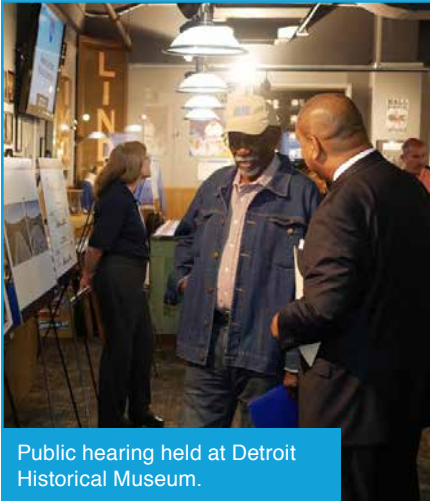
Public hearing held at Detroit Historical Museum.