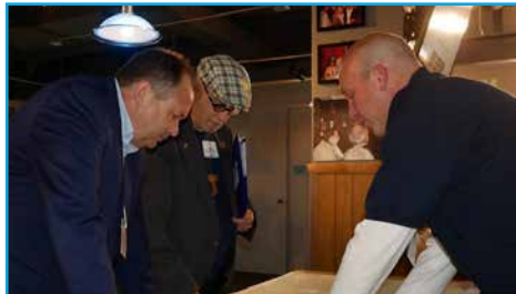
Public hearing held at Detroit Historical Museum.