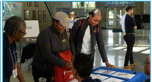
Public hearing held at WCCCD-Eastern Campus.