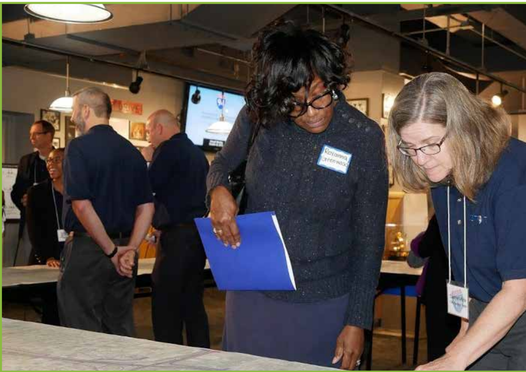
Public hearing held at Detroit Historical Museum.

In addition to commenting at the public hearings, MDOT hosted a formal public comment period from Saturday, Sept. 14 through Monday, Oct. 28. Comments could be sent both electronically and via U.S. Mail. The DSEIS document was (and still is) posted online at I94Detroit.org and copies of the document were available for review at eight local community locations.