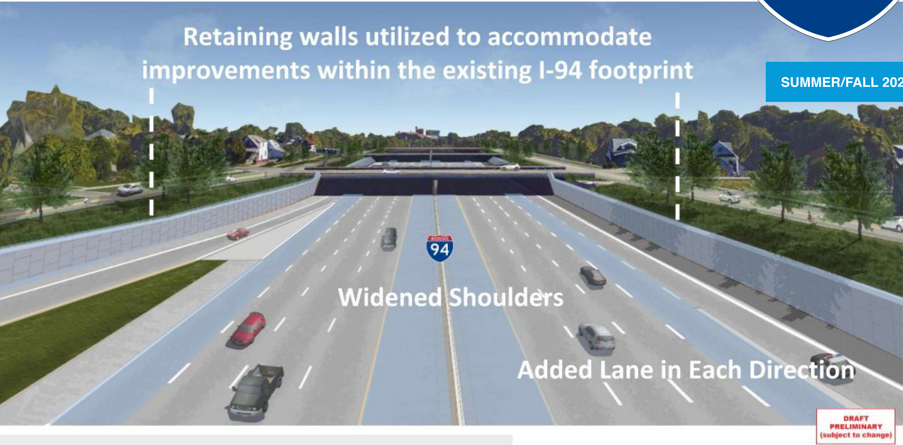
Above illustration shows the selected alternative for the I-94 Modernization project.