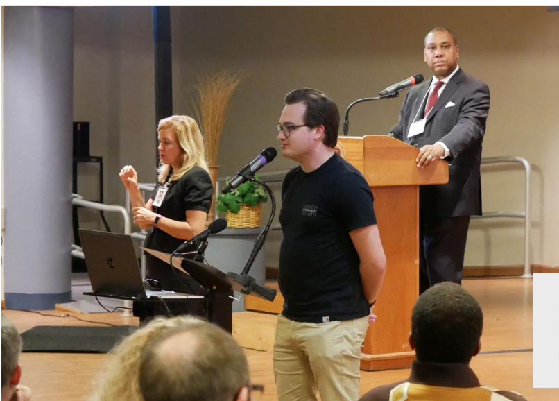
MDOT held public hearings at the Detroit Historical Museum and Wayne County Community College District – Eastern Campus on Oct. 10, 2019. Members of the public were invited to view exhibits and give formal testimony about a series of project modifications designed to increase neighborhood connectivity and mobility.

The Combined Final Supplemental Environmental Impact Statement and Record of Decision (Combined FSEIS and ROD) is more than 500 pages long. The following FAQ will help you understand key aspects of the document and find information that may be of interest to you.