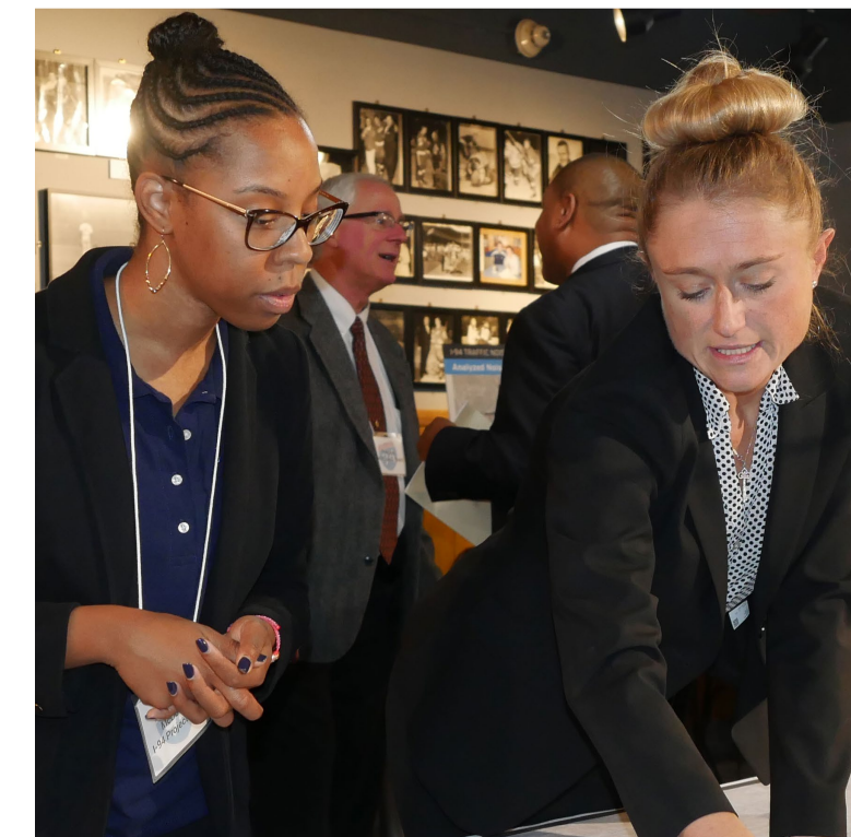
Public hearing held in October 2019.

Morning and Evening Session by Phone: Dial: 669-900-9128, Webinar ID: 938 7219 2824, Passcode: 466397